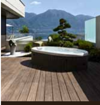
Residencia Lotus (1.600m²) Lago Maggiore, Switserland