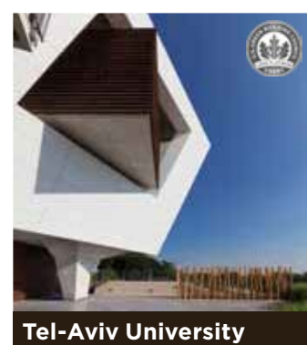
LEED Platinum - Israel