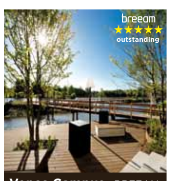
Venco Campus - BREEAM Outstanding - the Netherlands