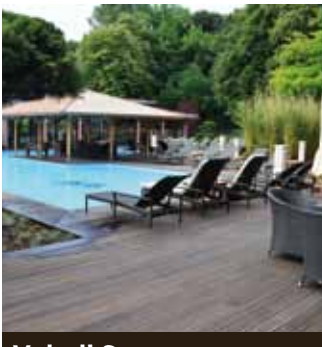
Vabali Spa (2.350m<sup>2</sup>) Berlin, Germany

Reaches fire safety class Bfl-s1 following EN13501-1 facilitating application in public projects.