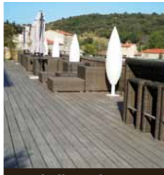
Hotel Riberach (1.200m²) Belesta, France