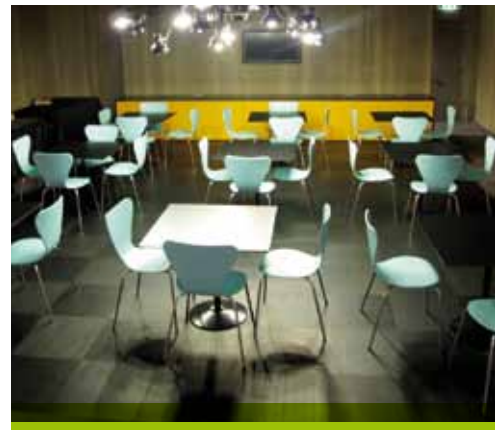
stadium FC Porto